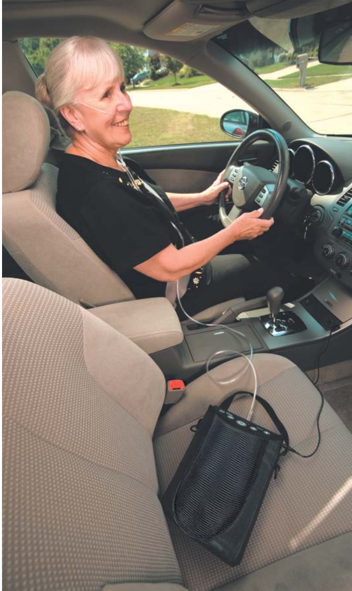
Convenient DC adapter and battery pack allow patients the freedom to travel whenever and wherever they want.